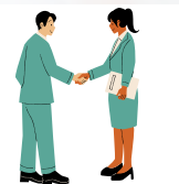
Merger and Acquisition