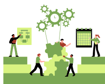
Consultancy Operations Management