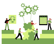
Consultancy Operations Management