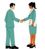
Merger and Acquisition